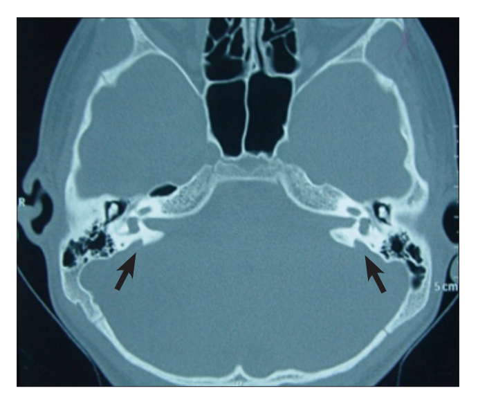
Figure 1. Axial CT section of the temporal bone demonstrating bilaterally large configuration of the vestibular aqueduct. ( Arrows: large vestibular aqueducts )

1 mg/kg methyl-prednisolone was initiated to the patient and continued for 10 days, thereafter; dose was gradually