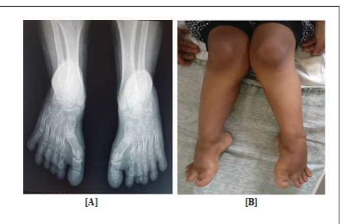
Figure 2: A] Knock knee/Genu valgum B] X-ray foot showing short metatarsals with six toes.

right atrium with QP/QS-5.65. Mean pulmonary artery pressure was recorded as 30 mm Hg. We operated on her with pericardial patch closure of ostium primum atrial septal defect and repair of cleft in AML with 5-0 prolene through right atriotomy on cardiopulmonary bypass after arresting the heart under GA (Figure 3B). Postopt recovery was uneventful. Echo was done s/o patch insitu with no residual shunt and no mitral regurgitation. The patient was discharged on the seventh postopt day after stitch removal with advice regular advice of six monthly followup. Recent follow up showed that the patient's symptoms have reduced with increased tolerance for work.