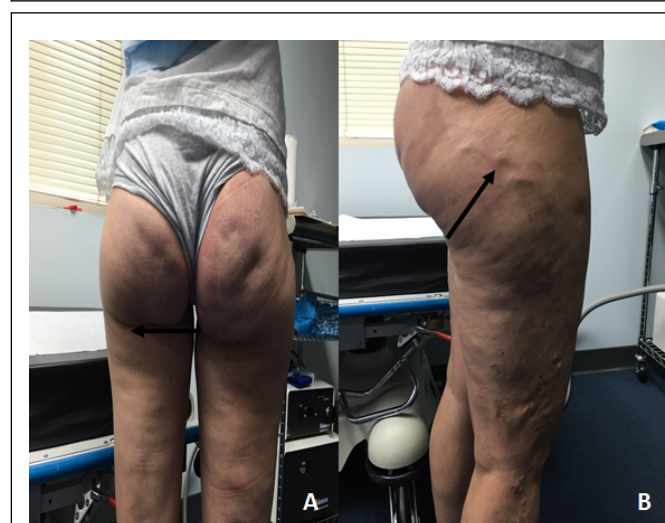
Figures 2: Posterior thigh varix emanating from the gluteal fold (1a). Postero-lateral varix extending from gluteal fold varix (2b).

Table 2 demonstrates the presenting symptoms of the study group. There were no differences in presenting symptoms except for pain. Pain was more common in the IVS and OVR+IVS groups compared to OVR (Table 2, p \leq 0.0034 ). Tables 3a-3d identify the CEAP classes for the entire cohort and of each of the treatment groups. Of the entire cohort, 95%, were CEAP class three or less. Forty-nine percent were less than or equal to C1 (Tables 3c and 3d) except for the OVR group where 55% of patients were C1 or less (Table 3b). For the entire cohort 48% of right limbs and 50% of left limbs demonstrated C0 or C1 disease (Table 3a).