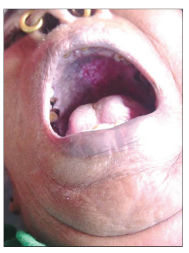
Figure 2: A superficial ulcer of 2 \times 2 cm over the hard palate in the oral cavity with an eroded surface with irregular margins and pseudomembrane formation

Cutaneous metastases are relatively rare and have been reported in 0.7-9.0% of all patients with cancer.<sup>[1]</sup> It may be an important clue for tumor progression or even the first manifestation of malignancy.<sup>[2]</sup> It has been reported that the lung is the most common primary site of carcinoma in men