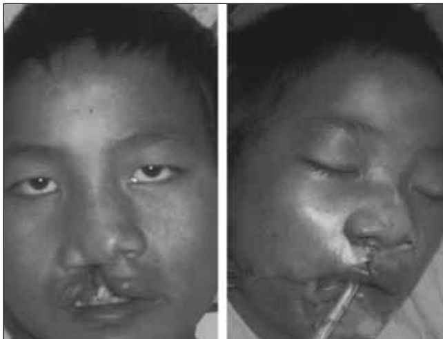
Figure 1) Before and after cleft lip repair in China

AMREF African Medical and Research Foundation; AUCC Association of Universities and Colleges of Canada; CIDA Canadian International Development Agency; CITA Christians in Theatre and Arts; CUSO Canadian University Services Overseas; EMAS Evangelical Medical Aid Society; SMART Surgical and Medical Action Relief Teams