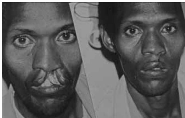
Figure 3) Before and after cleft lip repair in Kenya

transferred skin from the forearm to free up the thumb. He did not cry with the painful dressing removal the day after surgery. Tears of joy came to his eyes as he moved his thumb for the first time in four years. He would now have some independence to feed himself and use the washroom by himself.