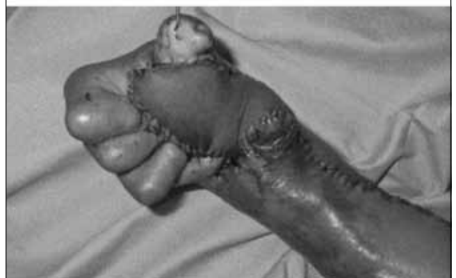
Figure 2) Hand burns before surgery (upper three photos) and after thumb release (lower two photos)