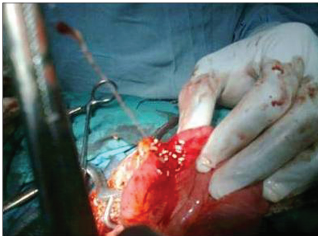
Figure 1: Surgeon pulling out the intrauterine contraceptive device from the intestine

The IUCD strings are used to monitor and remove the device. The presence of the string in the vagina usually means that the IUCD is in situ . A missing string is regarded as the first sign of perforation in approximately 80% of the cases. [7,8] However, because the IUCD was only partially extruded from the uterus, it is understandable that the string was still visible through the cervix. No attempt was made to remove the copper T IUCD by pulling on the strings because of the ultrasound diagnosis of ruptured ectopic pregnancy, which would require surgical treatment. The reported incidence of perforated IUCD is 0.87 per 1000 insertions, and occurs mostly during insertion. [9] The risk factors for perforation include clinician inexperience in IUCD placement, immobile retroverted uterus or post-partum insertion during lactation, when the uterine wall is thin. We suspect that uterine perforation in this patient would have started at insertion and completed later as she felt pain at insertion. Moreover, the insertion was also done during the post-partum period when the uterine wall is thin