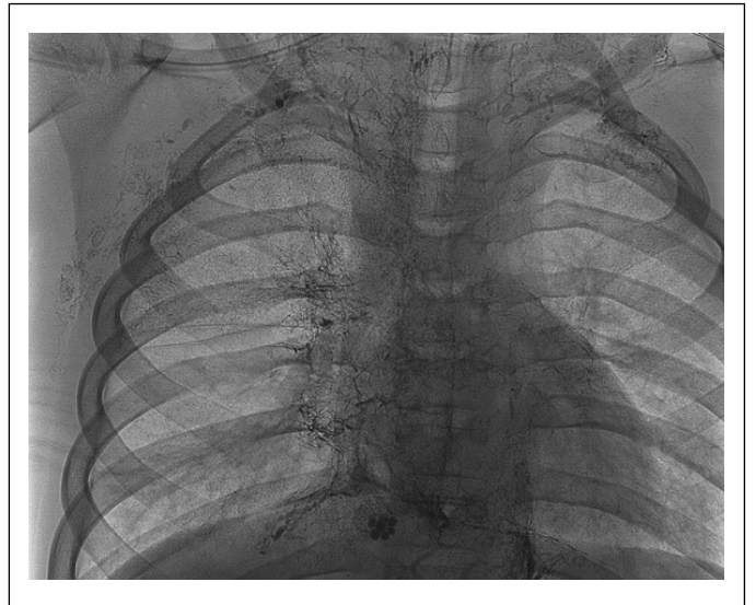
Figure 1) Chest radiograph demonstrating Lipiodol® in peribronchial lymphatic ducts.

Approximately one hour after admission on the PACU, the patient became acutely unresponsive and had a generalized tonic-clonic seizure. The seizure lasted only 30 seconds and faded spontaneously before any benzodiazepines were given. A head computed tomography (CT) scan showed countless hyper densities throughout the brain (Figure 2). When readmitted to the PACU, a new seizure occurred, lasting longer than the first one. Because the patient was desaturating as well, the trachea was intubated with 80 mg of propofol and 30 mg of rocuronium. An arterial and central venous line were placed due to hemodynamic instability and noradrenaline was infused. Levetiracetam was given intravenously and the patient was transferred to the pediatric intensive care unit.