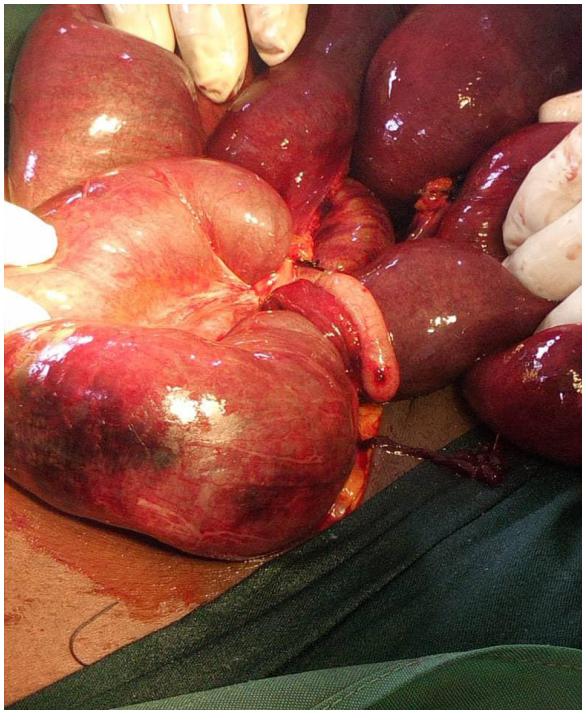
Figure 4) Intra-operative picture of cecal volvulus

All the patients had plain abdominal radiograph and abdominal ultrasound. Plain abdominal radiograph could diagnose sigmoid volvulus but not in transverse volvulus or in cecal volvulus. Figures 1 and 2 shows the radiograph of one of the patients with sigmoid volvulus with the positive coffee bean sign. Abdominal ultrasound was not diagnostic in any of the patients.