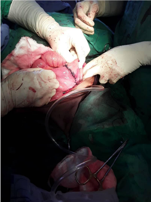
Figure 5) Anastomotic site following resection and primary anastomosis in a child with sigmoid volvulus