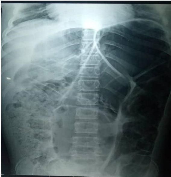
Figure 1) Plain abdominal radiograph showing the massively dilated loops of the sigmoid colon in a child with sigmoid volvulus