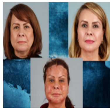
Fig.2. Patient with one week, hen 120 days and then 90 days