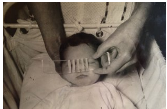
Figure 2) Early icterometer in use