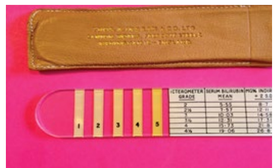
Figure 3) Later Ingram icterometer and case