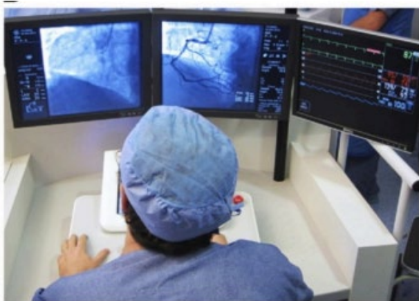
Figure 2(B) The operator seated at the interventional cockpit with control console for manipulating percutaneous transluminal coronary angioplasty devices and the angiography and hemodynamic signs monitors positioned at his eye level.