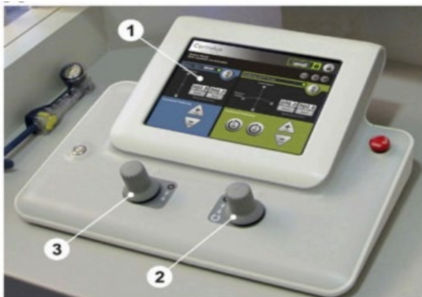
Figure 2(A) Representative picture of the control console: 1 – touch screen controls; 2 –guidewire joystick; 3 –balloon/stent catheter joystick