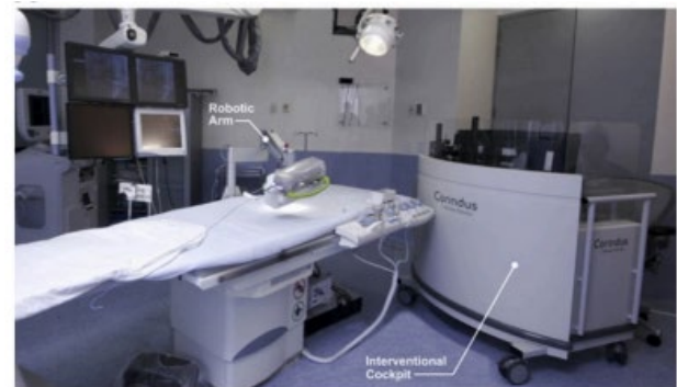
Figure 1(A) Typical set up of the equipment in the catheterization laboratory: bedside unit mounted on a bedrail, and the Interventional Cockpit is positioned at the foot of the procedure table