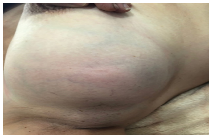
Figure 1) Picture showing two lumps in the right breast.

and the family Taenia . The disease exists in two forms: the larval stage [metacestode] and the adult stage [tapeworm]. Parasites are perpetuated in life cycles with carnivores [dogs and wild canines] as definitive hosts. Humans are the accidental intermediate host [dead end] and animals [herbivores]