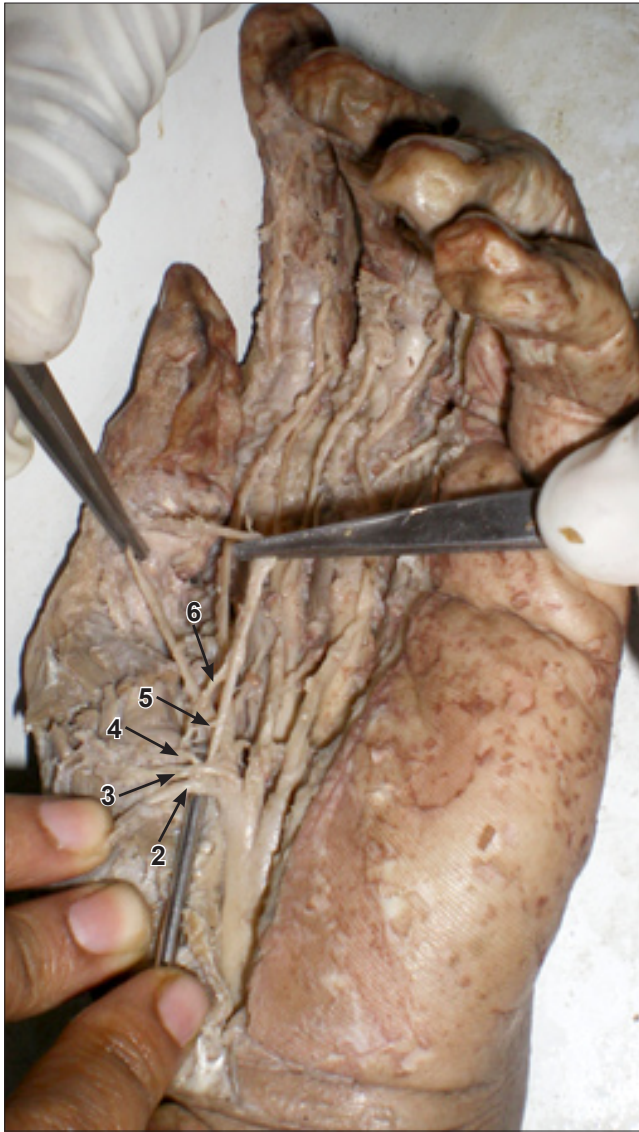
Figure 1. Photograph showing multiple thenar branches (2, 3, 4, 5, 6) of median nerve, except first and seventh.

was observed. Akio studied variations of the branching pattern of median nerve and their variant course in a series of 147 hands in which the carpal tunnel was explored during surgery. One hundred and fourteen hands had one thenar branch, 23 hands two and 10 hands had three branches [3]. Alp et al. studied ramification pattern of the thenar branch in 144 hands of 74 cadavers and found that thenar branch was a single trunk in 84% cases, two branches were observed in 13.2%, three in 2.1% and four branches in 0.7% cases [4].